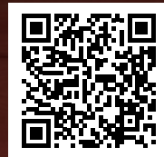
Click or scan to for Movie times.